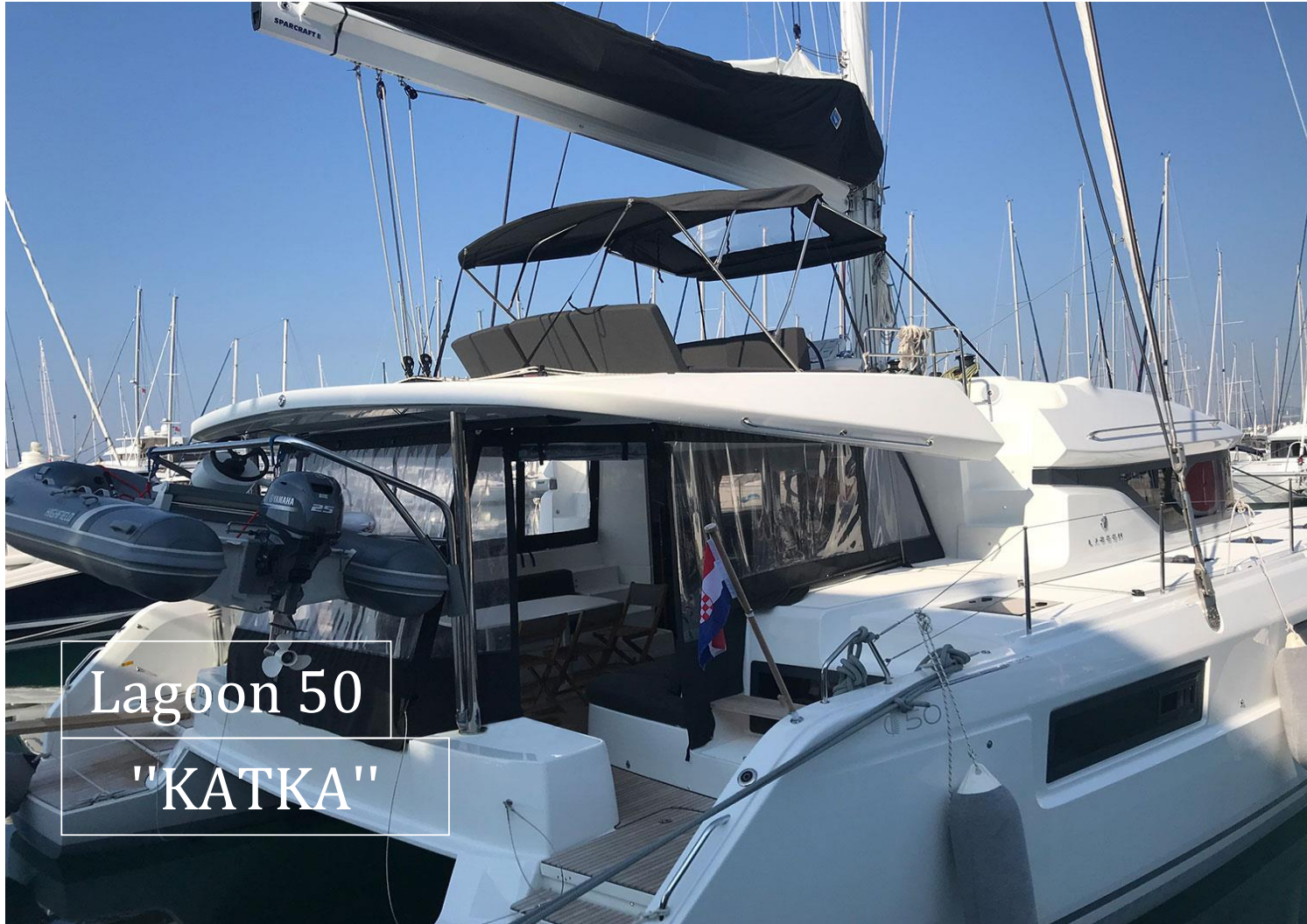
Lagoon 50 "KATKA"